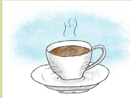
Cafes and bar