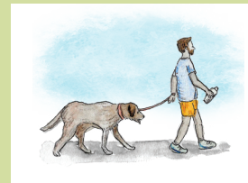
Dog walking (on lead)