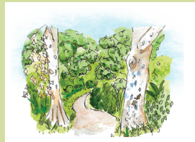
Brooke St Reserve