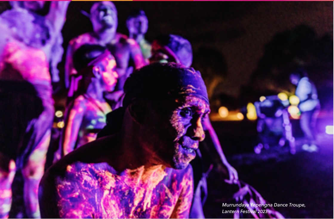
Murrundaya Yepengna Dance Troupe, Lantern Festival 2023

Banyule celebrates our diverse cultures and community with a busy calendar of major festivals and events, which run from November to March each year. These events are free to attend and are designed to inspire, connect and heighten a sense of belonging for all.