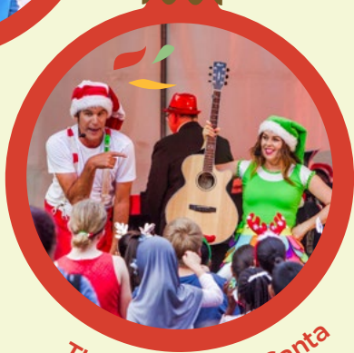
The Kazoos and Santa