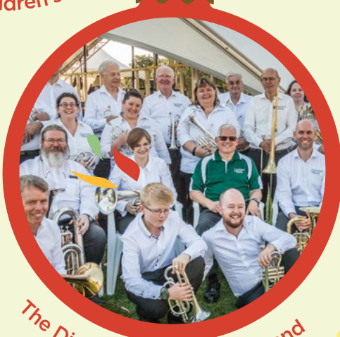
The Diamond Valley Brass Band