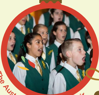
The Australian Children's Choir