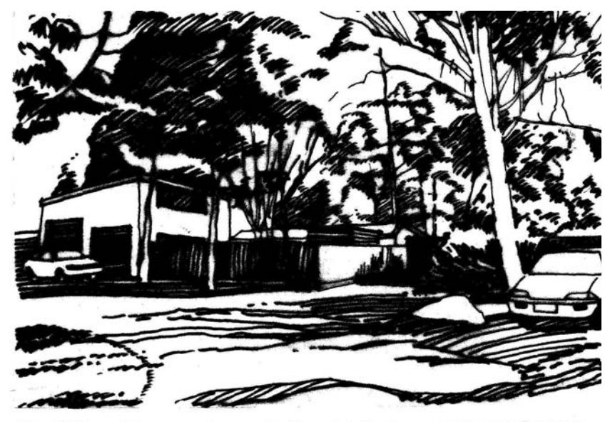
Typical Inner Reserve environment with point of entry, rear fences and garages

Barriers within the inner reserves should be of sawn and dressed red gum, painted buff or unpainted, the upper rail being checked into the supporting posts at 45 degrees to shed run off and conform with practices appropriate to the period of significance of the estate.